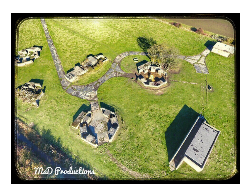
133 Battery, Anti Aircraft Regiment, Stone Creek, Sunk Island.