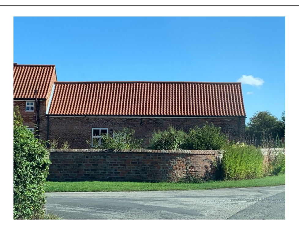
Manor Farm barn where Lockyer was taken to after the crash and from where was taken, the following morning, to RAF Catfoss.