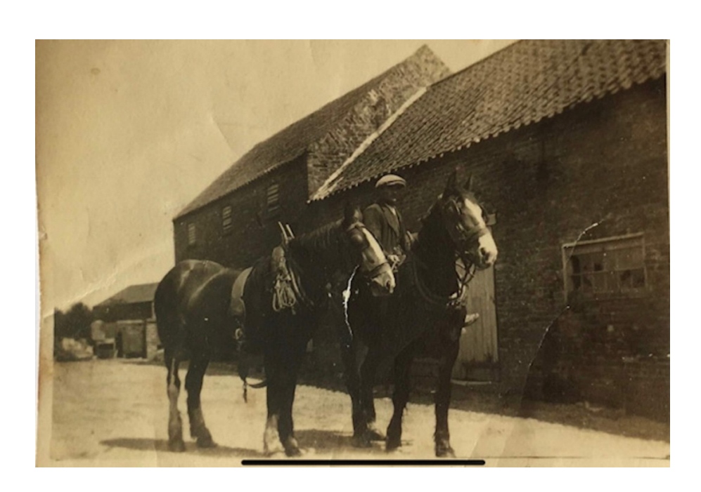
The barn between 1930 and just after WW2 before it's restoration (as shown in the photo above).