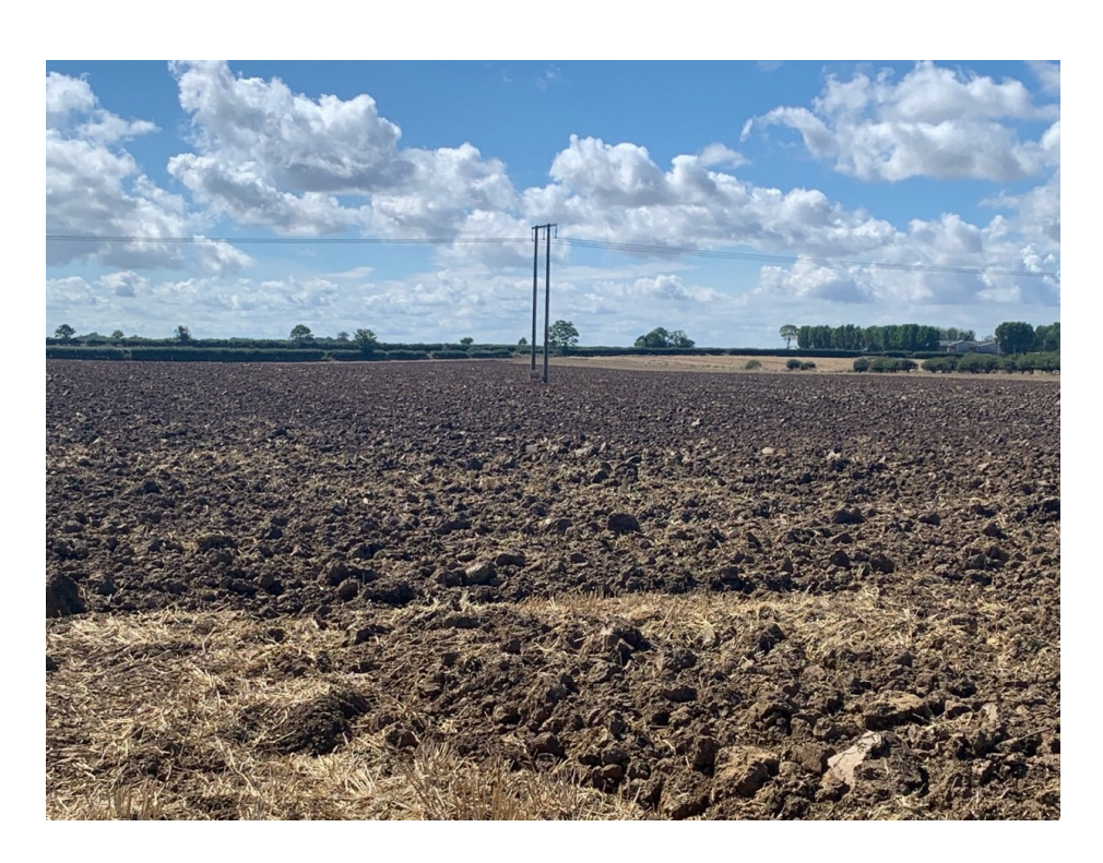
Crash site of NG132 in dip the other side of the line of stubble, where the ground changes colour.