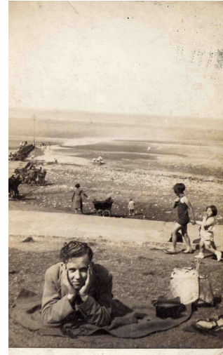
The same day?