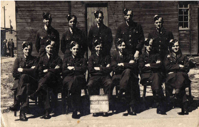
Third from left on front row