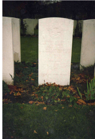
Grave at Berlin