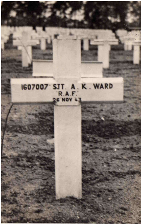
Grave at Getlow